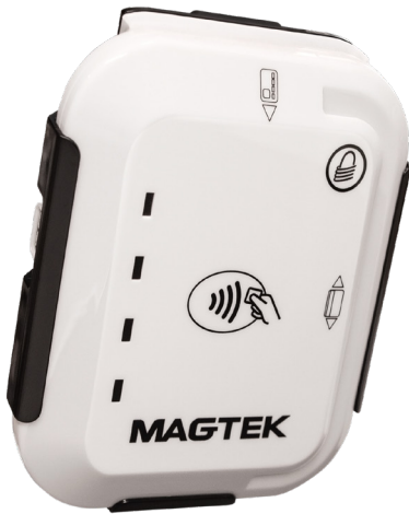
BACK AND FRONT WITH tDYNAMO Attached to clip back (on top) and front (below) shown here.

MAKE IT EASIER TO ACCEPT MOBILE POS TRANSACTIONS WITH MAGTEK MOBILE POS tDYNAMO AND uniVERSE CLIP