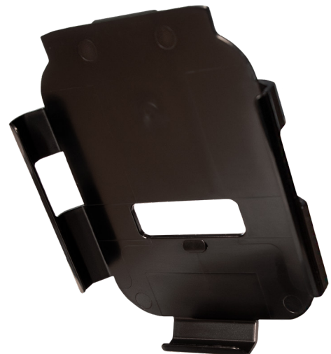
Clip side and side angle shown here. Clip designed to allow for micro-USB access.