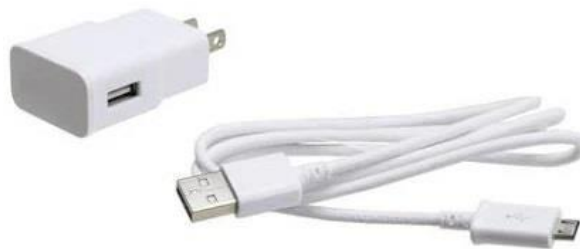
USB cable and Charger